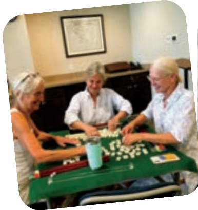
LCL Mah-Jongg Maniacs Players