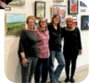
LCL Art Display - Artist