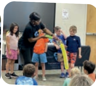
The Science Heroes

Shhhh..... Not anymore! The library isn't the quiet place it used to be-it's now the center of laughter, learning and family fun. Our motto is: "Every day is Fun Day at the library." I hope you haven't been missing out on the fun.