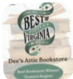
Best of Virginia