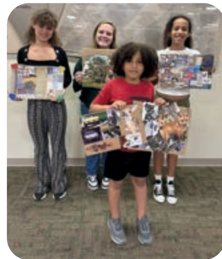
Teen Craft Night

We've implemented two weekly programs: Craft Night on Wednesdays and Game Night on Fridays. Both programs have quickly become favorites among our regular attendees. This fall, we also launched the Book Worms Teen Book Club, meeting on the first Monday of each month to discuss popular and thought-provoking reads. In partnership with the Lions Club, we hosted 10 aspiring teen artists for their annual Peace Poster Contest, providing space and support for students to create and showcase their artwork. We're also thrilled to introduce our first annual Teen Center Raffle Reading Challenge. High school students (grades 9-12) earn raffle tickets for every book checked out from the Teen Center, with a chance to win cash prizes during our December 17th drawing. These initiatives continue to foster creativity, literacy, and community among our teen patrons.