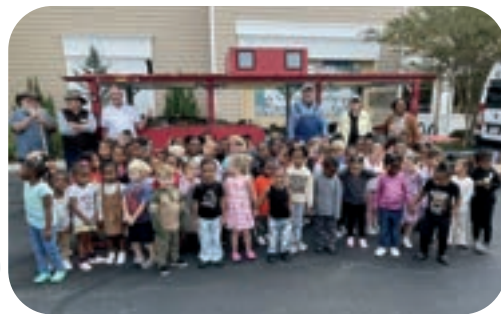
Storytime Special Guest Rappahannock River Railroaders