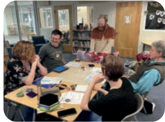
Dungeon & Dragons Guild Members

Most recently, the Lancaster Community Library has established its own D&D group. We meet weekly, on Wednesday evenings from 5:30 to 7pm. Player skill level ranges from beginner to veteran, allowing for a wide range of experiences regarding the game. There are presently a total of 5 members of the group, including myself (a noob). Meetings revolve around gameplay, proceeding through our quest, solving puzzles and trying (and often failing) to identify parts of the fantastical world of the Forgotten Realms. Due to the nature of Dungeons & Dragons, potential members must register to join; currently, registration is closed but will open up again near the end of the group’s campaign, likely after Thanksgiving. Keep an eye out on our social media to know when registration opens up again!