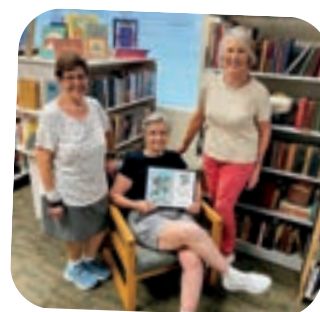
Our wonderful volunteers!

Since June, Dee’s Attic Bookstore has continued to thrive as a vibrant hub for book lovers and community engagement. One of our key highlights was the Summer Book Sale, which was a great success! Drawing in record foot traffic, selling 4,722 books, and raising more than $7,200 for our programs. Following the sale, we proudly donated the remaining books to four local community organizations, helping to spread the love of reading throughout our community. We’ve also introduced monthly themed pop-up sales featuring curated collections such as science fiction, leather-bound classics, children’s books, geography titles, and brand-new fiction. In October, we launched a special “Trick or Treat” sale featuring like-new paperback fiction, which was a hit with both new and returning customers.