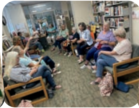
LCL In Stitches