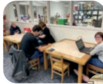
LCL Creative Writing Group

The Artist Display Program offers local artists and groups the chance to showcase their work in the hallway leading to the Children’s Library. Hundreds of visitors pass through weekly, giving artists valuable exposure. Participants can also host a mid-month reception to meet patrons and share their artistic stories. Together, these programs highlight Lancaster Community Library’s dedication to creativity and community engagement.